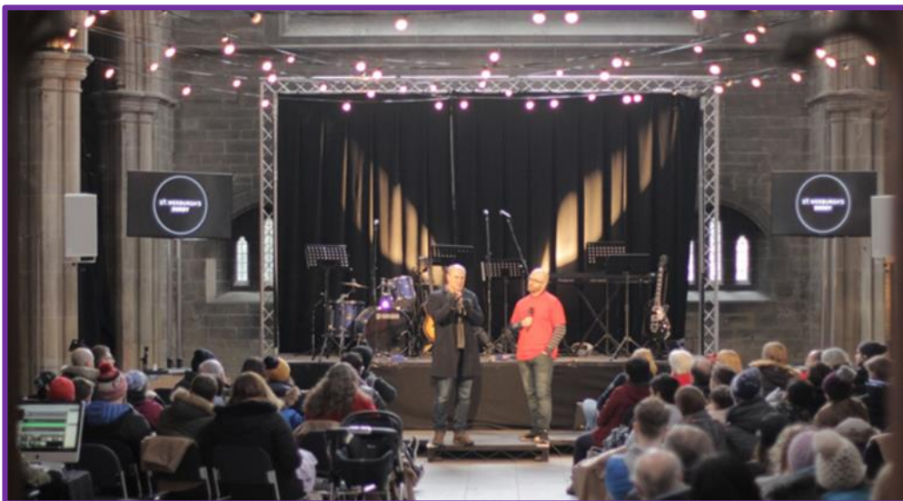
our morning service launch

We have now been open for over six months and it has been such an exciting start!! We are so grateful to God for all that He has done and all that has gone on. For over 30 years the building has not been used as a church so being able to open up St Werburgh's and see it come back to life as living, worshipping church is amazing. The church was launched on September 17th with over 300 people attending, from all walks of life and every age and stage, to pray, worship and welcome in this new church. We served bacon cobs and homemade chocolate brownies which seemed to be well appreciated!